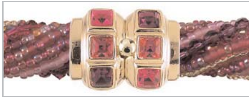
Combine colors to create a stunning focal piece