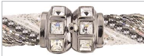
Exotic and elegant ruthenium finish with crystal.