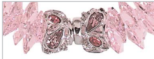
offset crystals for trend-setting modern style