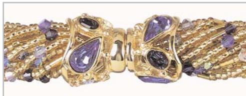
seedbeads & crystal flow together seamlessly