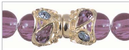
14mm bead tucks-in for a smooth transition