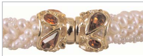
multiple strands of pearls for a tailored look