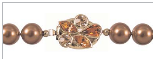
add an unexpected splash of sparkle to pearls