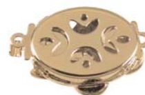
attention to detail - even the back is beautiful