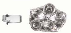
press-n-pull lever is secure & easy to open

Clasp style: Montage Skill level: easy Time approx: 10 minutes Crystals to glue: 5 Size approx: 23x15mm Nickel-free plated finishes: • rhodium • gold plate