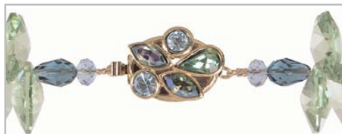
multiple crystal colors reflect necklace style